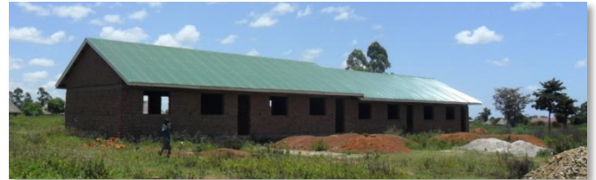
Old (above) and new (bottom) primary school buildings

Our goal is to support the entire school career of vulnerable children, from preschool to secondary school, giving priority to the quality of education. We build on a strong partnership with Bukedea Lifeline Schools. These are among the best schools in Uganda, and the directors are familiar with local problems and solutions. We thank our supporters for their help. They give children from poor families the chance to receive a good education.