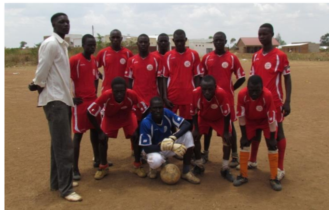
Football is serious business! – The Bukedea school football team

The FC Bayern Munich fan club "Limespower Markt Weiltingen" is one of our supporters and equipped the school football team with shirts and shorts for two whole teams. The ceremonial handover of the kits took place at an official football tournament. No doubt FC Bayern Munich was able to win new fans in Uganda. We thank Limespower Markt Weiltingen for the generous donation. You have raised the hearts of many football fans.